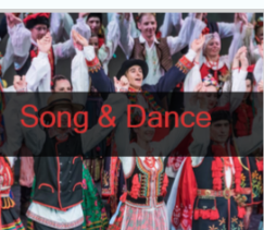
Song &amp; Dance